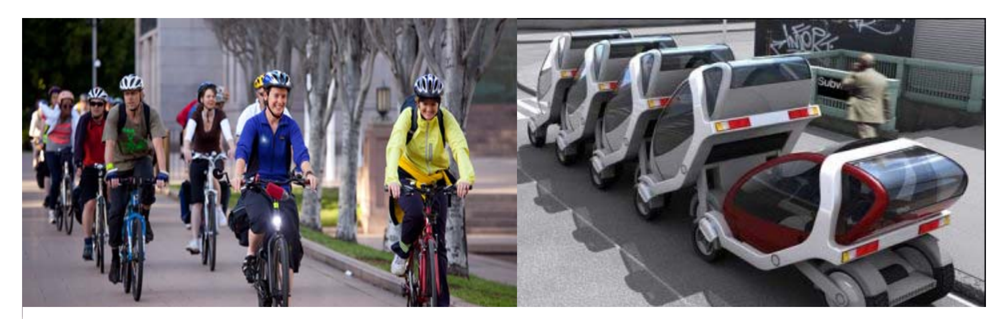
In cities, opportunities and challenges meet